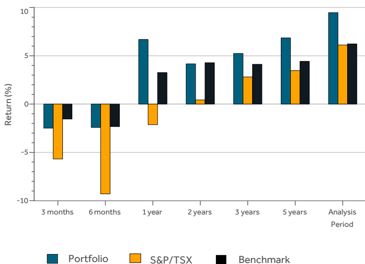
Manager vs Benchmark: Return